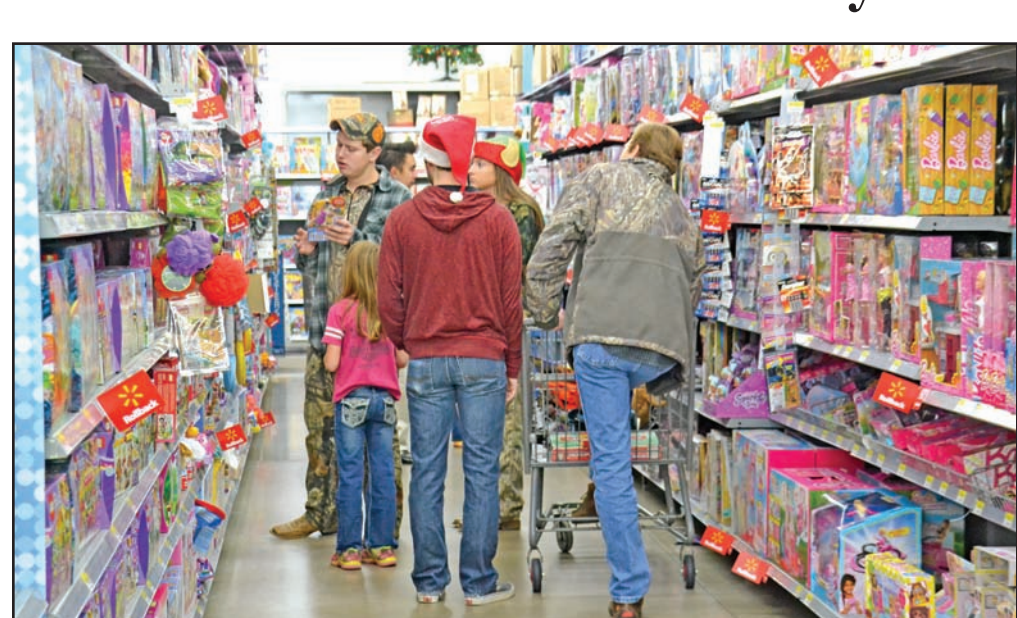
Dozens of Union County High School students took a group of second-graders shopping for Christmas last week as part of their annual Shop With A Panther program.

them shop. "Each kid gets $150 to spend, and we have about 30 kids," said UCHS Principal See Christmas, Page 3A